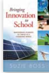
Bringing Innovation to School