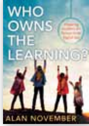
Who Owns the Learning?